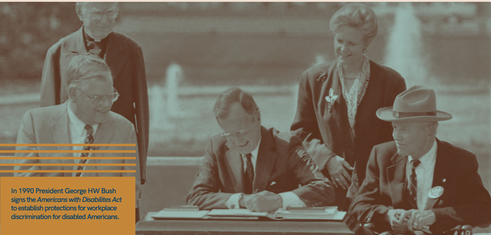
In 1990 President George HW Bush signs the Americans with Disabilities Act to establish protections for workplace discrimination for disabled Americans.

In the 1960's, legislation began to consider people with "special needs" or "cognitive disabilities" (there was a different, outdated slur term used back then) as actual human beings with some rights, rather than people who were institutionalized,